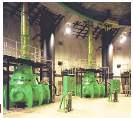
Main Sewage Pumps 18,720m 3 /h - 37.3m - 2,500kW - 8units