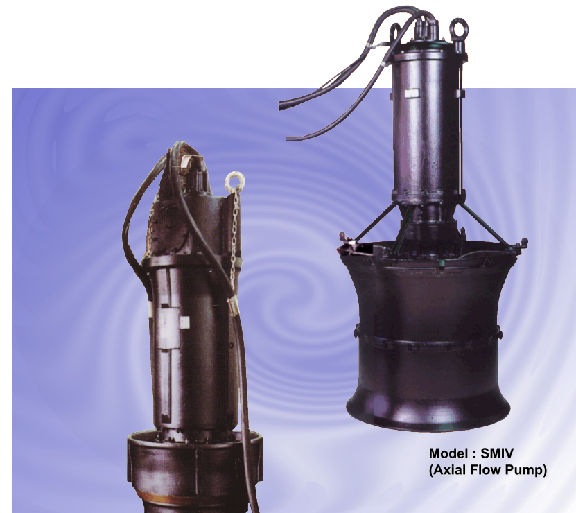
Model : SMIV (Axial Flow Pump)